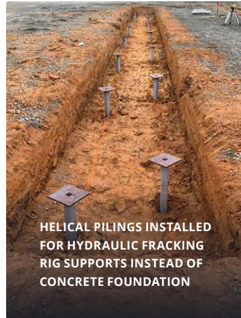
HELICAL PILINGS INSTALLED FOR HYDRAULIC FRACKING RIG SUPPORTS INSTEAD OF CONCRETE FOUNDATION